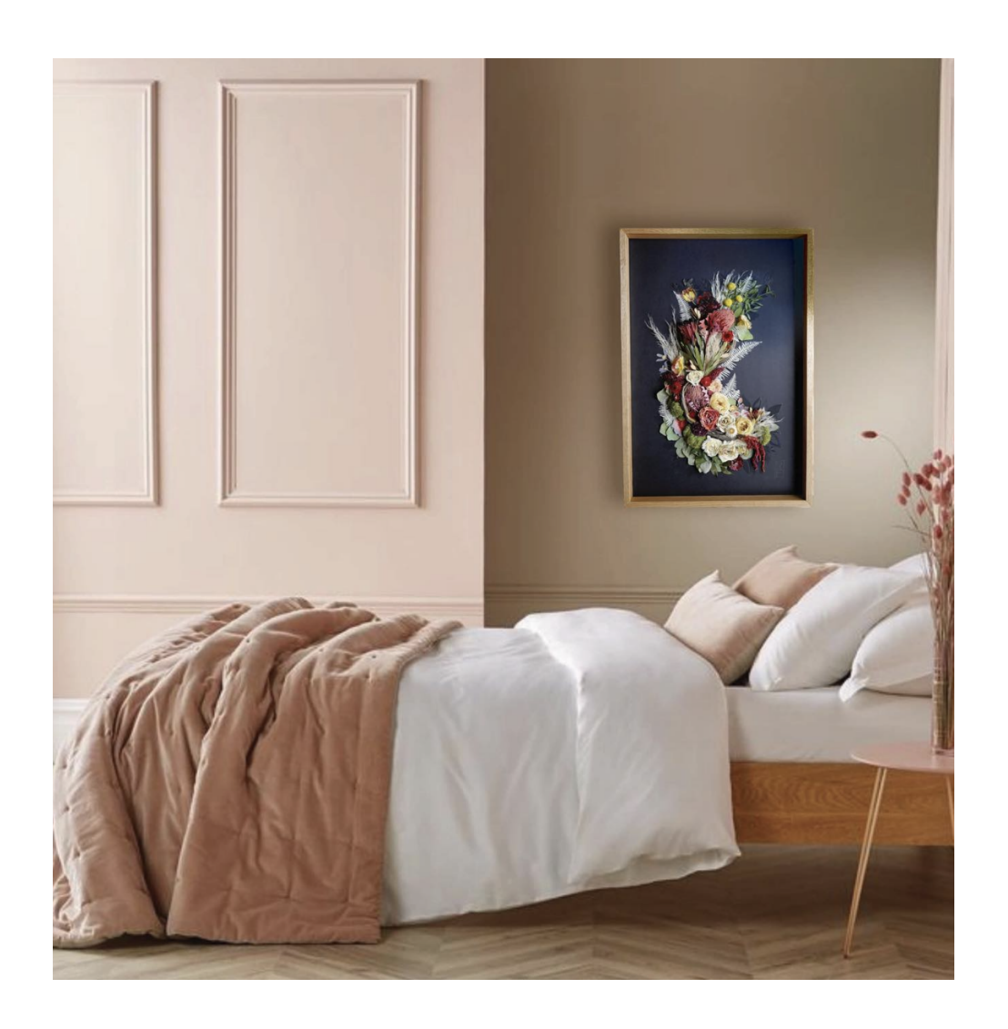
Re-Create • Re-Live • Re-Tell

Flowers mark all of the most important moments in our lives: graduations, promotions, engagements, marriages, births, and deaths. We can capture the special memories from each of those events, the love shared, the relationships reflected, the moments cherished forever in flowers that will not fade.